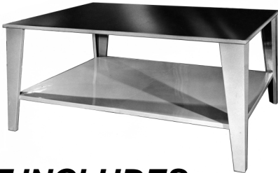
Table Top covered with non-skid rubber