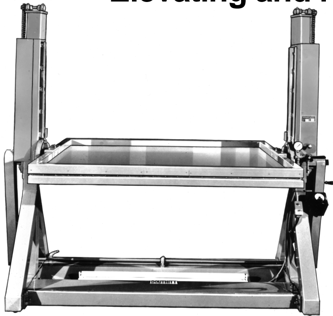
NOW STANDARD WITH OPTION "X" FASTEST CONTACT • BEST REGISTRATION