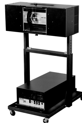
Printing Lamps see pages 14-15