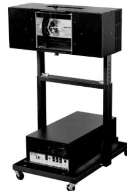
Printing Lamps see pages 14-15

Sizes up to 128 x 300 — details upon request