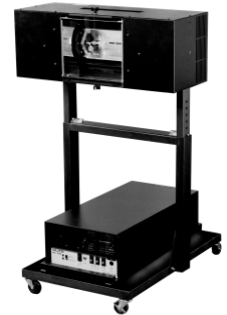
Printing Lamps see pages 14-15