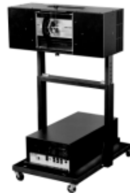
Printing Lamps see pages 14-15

Sizes up to 128 x 300 — details upon request