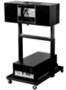
Printing Lamps see pages 14-15