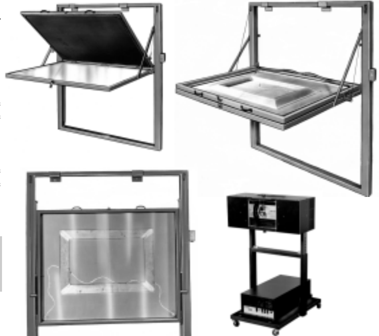
Printing Lamps see pages 14-15