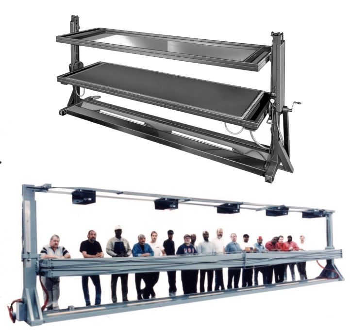
Customized Models Available Single or Double Sided